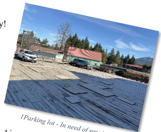
!Parking lot - In need of repair!!

We are heading into one of the busiest months at the lodge. I'm looking forward to working with all of you and sharing our Norwegian heritage/culture with the town and its visitors.