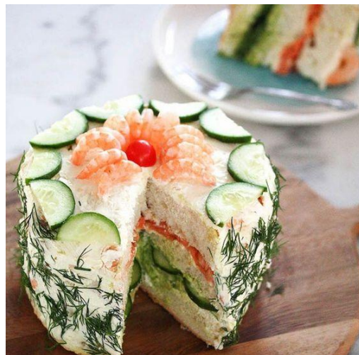
Smoragstarta

On April 19th I am taking a class called “101 Smorgasbord” - history, traditions and recipes included - sounds like fun! Then May 3rd I am taking a class on “Smoragstarta” (Sandwich Cakes) which I have been interested in for many years. I have been collecting photos, ideas, and recipes, so when I saw the class listed this spring I signed up. My plan is to host/share a class or two on how to make, cut and serve them later this summer.